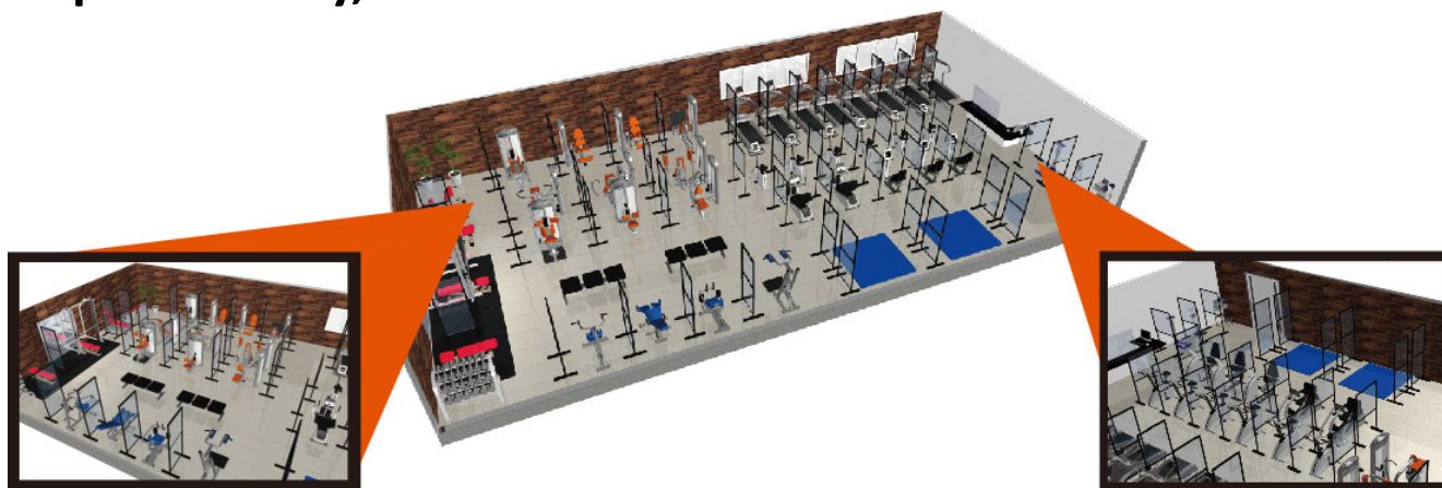
Weight Stuck Machine Area