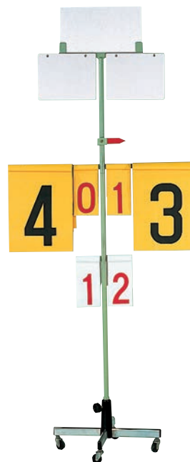
DS0650 Manual Score Board