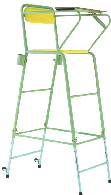
DL2020 Referee Chair

Floor Apparatus to be installed previously under the floor before setting the net post up. Construction may take about 7-14days.